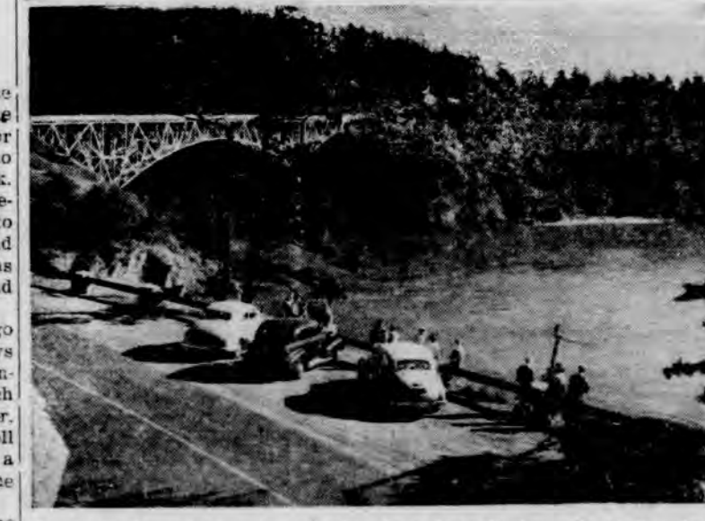
Deception Pass Bridge in Deception Pass State Park on Puget Sound in the State of Washington, connects Whidbey, the nation's second largest island, to the mainland. The park is a favorite recreation spot with both residents and out-of-state visitors.

Representatives from all clubs and civic organizations in the upper valley have been invited to attend a special meeting of the Oak Harbor Chamber of Commerce at that city next Wednesday evening, November 2nd. The subject of the meeting will be "military development of the northwest".