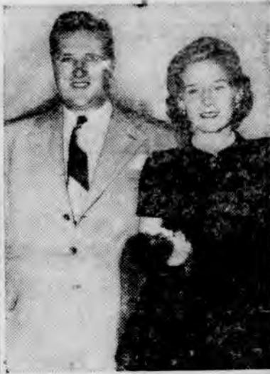
VACATION'S END . . . Henry Ford II and his wife arrive in New York aboard the Queen Elizabeth after short vacation trip. Ford faces a demand by CIO United Automobile Workers for a fourth-round pay boost.