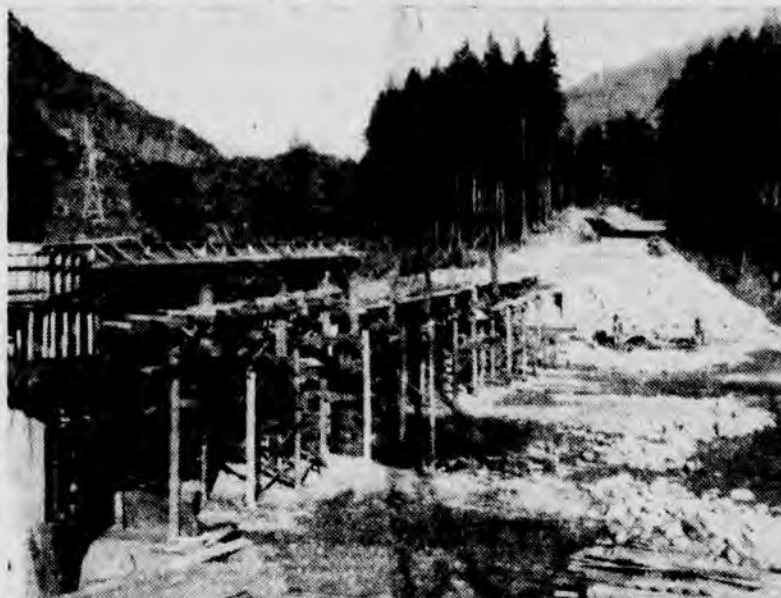
Forms are now going up on the new Skagit river bridge just below Diablo. This bridge is the link between the present Newhalem-Drabro road with the new section of the North Cross-State Highway now under construction between Diablo and Thunder Creek.