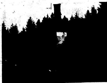
A home belonging to the E. H. Walkers, located at the West end of the Concrete Airport, below the air strip on the Dalles Highway, was completely destroyed by fire during the night last Tuesday. First indication of the blaze came Wednesday morning when early motorists noticed the