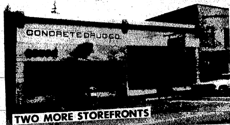
TWO MORE STOREFRONTS

Jack Mobley has purchased the house of Wayne Squier facing on the alley back of the Mt. Baker Hotel. Mobley will complete the reroofing of the building and fix it up for a rental.