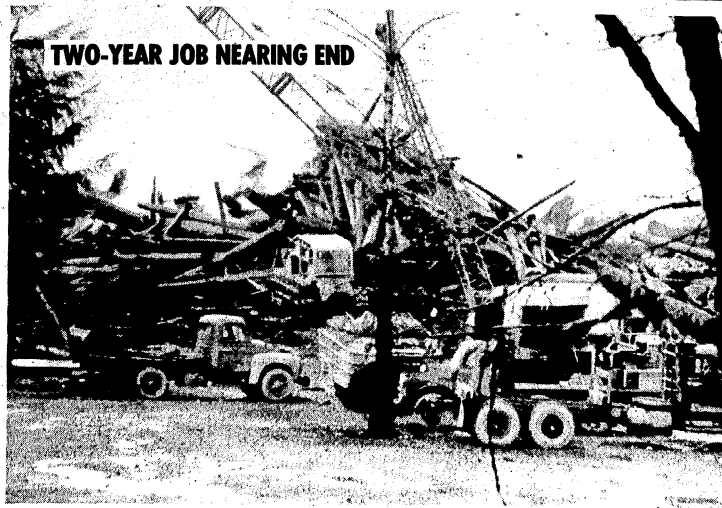
TWO-YEAR JOB NEARING END

Vol. 69, No. 47, Wednesday, November 26, 1969