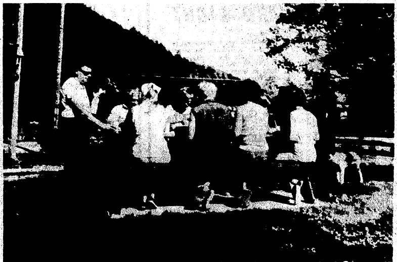
PICNICKERS enjoy Concrete Juniors Community Park near Baker River Bridge on Fourth of July weekend. Three picnic tables were in place in time for holidays. Her- bicide had poured slabs during a previous work session at new park site.

The Concrete school board will meet next Monday, July 13, at 8 p.m. in the superintendent's office. The monthly meeting has been changed from the regular Tuesday meeting night.