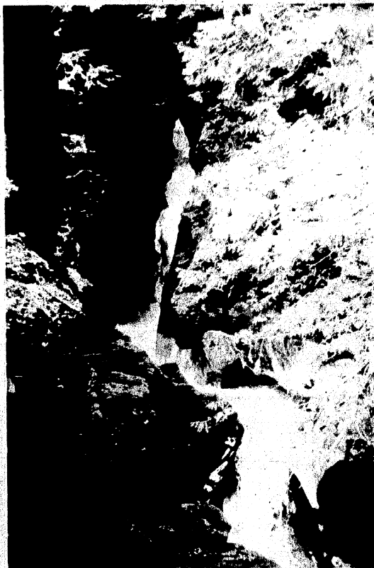
Ladder Falls at Newhalem is one of the showplaces of the valley, either day or night. The falls are illuminated with colored lights after dark and are now open every evening for visitors.

The regular meeting of the Town Council will be held Monday evening, August 3rd, at City Hall at 7:30.