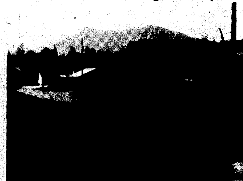
The Town of Concrete got quick service on their request for blacktop paving last week. The council approved a quotation Monday night for Associated Sand & Gravel Co. to pave Limestone and E Streets to complete a job started last year but stopped for lack of funds. Two days later the job was done. The company had a job at Marblemount and stopped by on their way back down river. Cost of the project will come partly from state arterial funds and partly from the street fund.