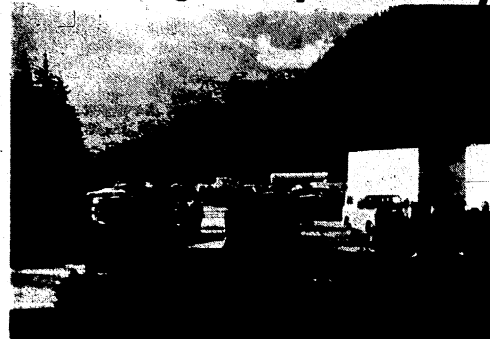
FIRST TRAFFIC JAM AT RAINY PASS

But the really loud music was in the hearts of the men who had pushed for the highway over the years—many long years. The fight had lasted so